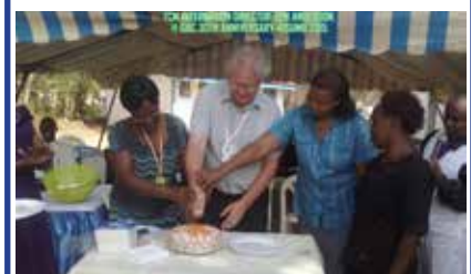
2015 National Conference in Kisumu