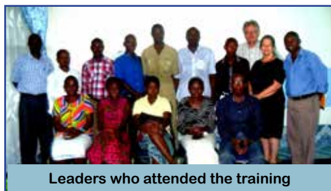
Leaders who attended the training