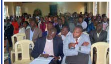
2013 National Conference in Embu