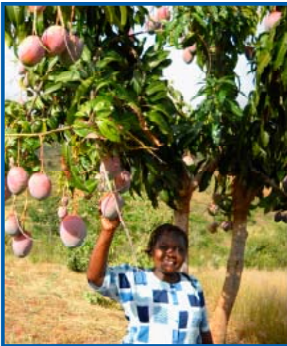
Charity eager to pick mangoes

day to and from the seminar venue. Sometimes we soaked our blistered feet in warm water while we peeled and ate sweet mangoes. In short, the Lord kept us healthy.