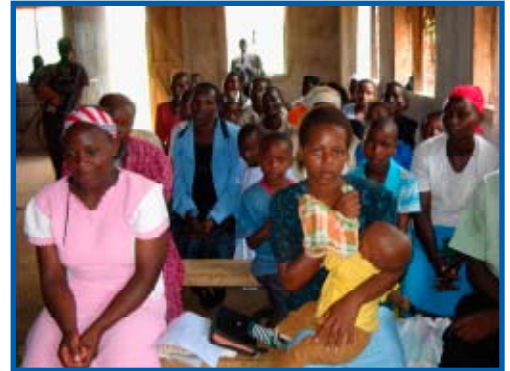
Sunday School Seminar Graduation in Mitunguu