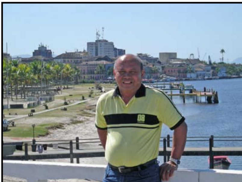
Trip to Paranaguá

In our last prayer letter we mentioned our plan to start a church planting ministry in the city of Paranaguá , Paraná . We continue to ask your fervent prayers for the said plan because it is