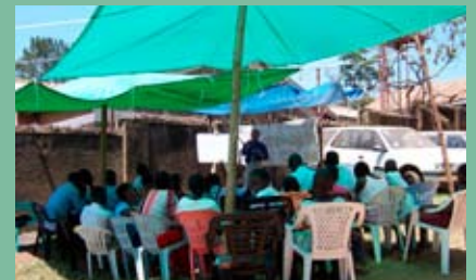
Worship under a tent, February 2005