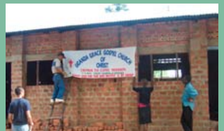
Permanent structure Bricks 2009