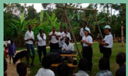
Youth teaching the orphans