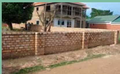
The site for the church & school buildings