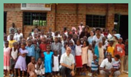
Permanent structure 2010