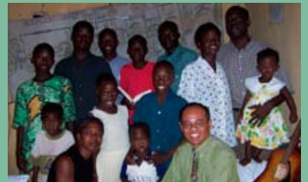
First worship in a home Jan.16, 2005