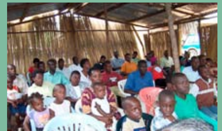
Worship in a Papyrus structure May 2006