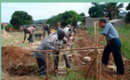
Beginning the fence