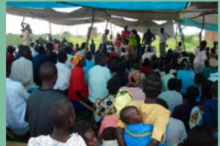
In the village ministry: preaching & distribution of goods!