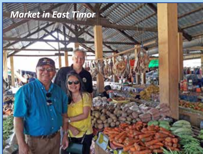
Market in East Timor

are Tetun and Portuguese. Few people we met could speak English. The country's currency is US dollars and the cost of living is high. Roads and transportation are undeveloped, with old cars used as taxis in the city, running 20-30 miles per hour. Sometimes when we got in a taxi we could not open the door from the inside and had to roll down the window and open it with the outside handle. Some taxis had wires tied around the door to keep it from falling off. Other taxis attract passengers by adding some rare decorations. One of the things that attracted us is that East Timor has good quality rice and coffee. The Timorese people are hospitable and really in need of the gospel. It's a nation dominated by Roman Catholicism. We do not have any contacts yet but believe the Lord will open a door of spreading the gospel of the Grace of God. Please pray for our plan to move to that small nation.