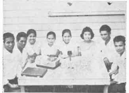
Student Radio Ministry

"Faith cometh by hearing and hearing by the Word of God." Messengers of the Grace of God to the city of Ozamis via the local broad-