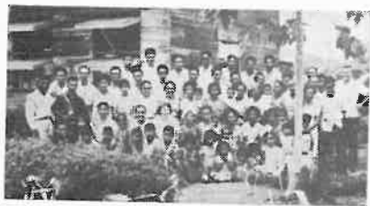
Congregation at Baluron

compare, but we don't see what he is really doing until we get out where he is and watch him at work. There seems to be no end to his zeal and ambition. We had meetings in the morning, afternoon and evening at Baluron.