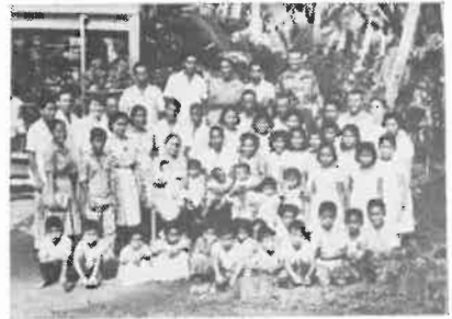
Congregation at Canibungan

High upon a mountain is the barrio of Canibungan. Here three students have spent concentrated efforts in evangelism. Many have come to know Christ as Saviour in this barrio and as a result a new chapel is now built.