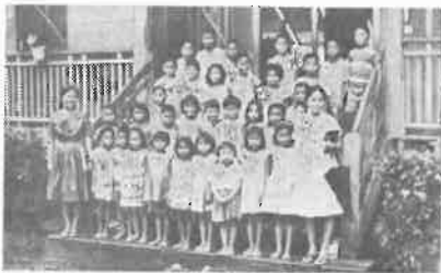
Public School Ministry

"Now then we are ambassadors . . ." in the barrio public schools. The cen-