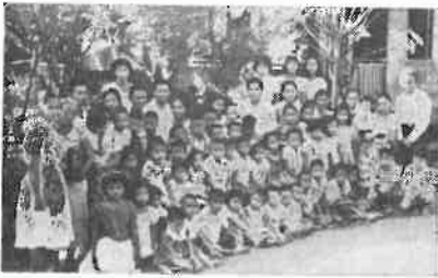
Congregation at Tenaclaan

During the recent Christmas vacation a student took on the task of bringing the "Grace Message" to Tenaclaan.