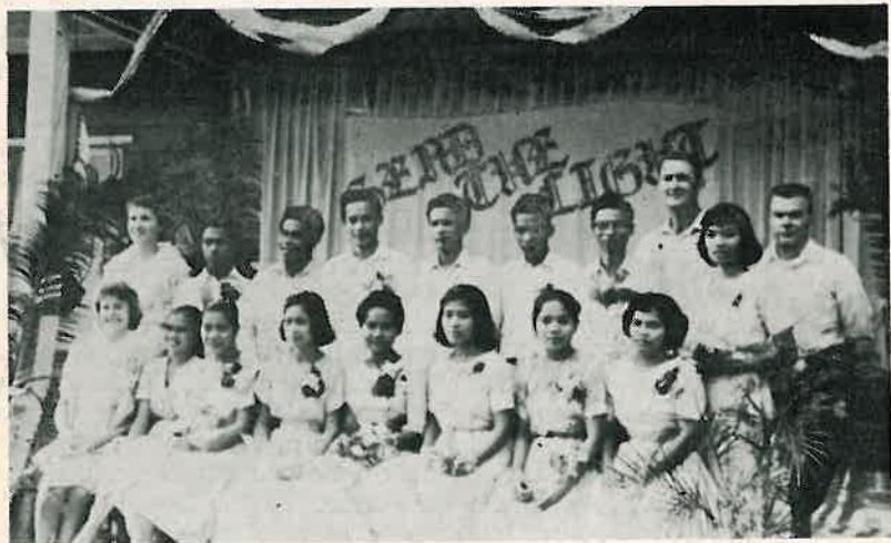
Graduates of the first three-year course at the International Grace Bible Institute of the Philippines. Fourteen students were graduated March 16th. Thirteen have entered the ministry Proclaiming the Gospel of the Grace of God in the Philippines.