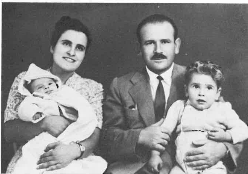
Dimitrios Karagounis and family, translator of the New Testament in the modern Greek language.

ing. In God's providence he and Brother Vergopoulos were brought together. Then Karagounis began the big task of translating the New Testament in the language of the Greek people today.