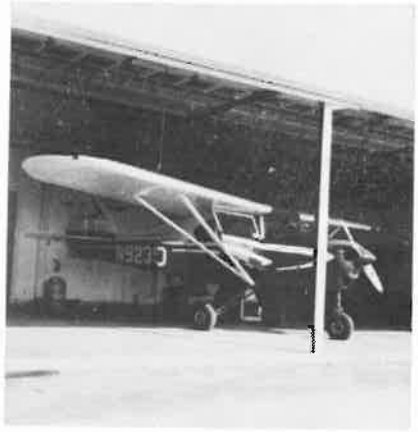
God's answer to prayer. This is the plane being sent to Philippines.

Transportation in the Philippines is far from ideal. Travel is one of the handicaps in evangelizing this country. Time and energy are wasted in traveling by the busses (which are never on schedule) and by walking into the areas not accessible by roads. One way to reach these barrios in a short time is by air. For the past year we have prayed and looked to the Lord to supply this needed form of transportation for the missionaries. Prayer was answered this spring and a plane was provided.