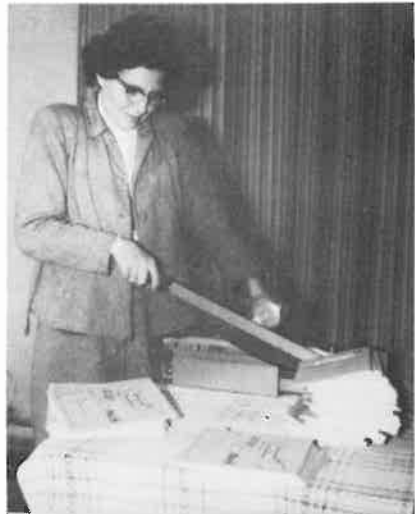
"Trimming" is part of the work of this publication

who will stand with us in this message. I have just received word from a sick lady whom I visited, telling me how much she was helped by one of the articles on "The Bible and Healing". My sister-in-law said the same thing