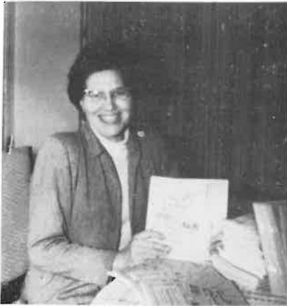
It's ready for mailing, except the addressing

and we have just received a letter from a man stating that he believes we are on the right track and he can now pray for us.