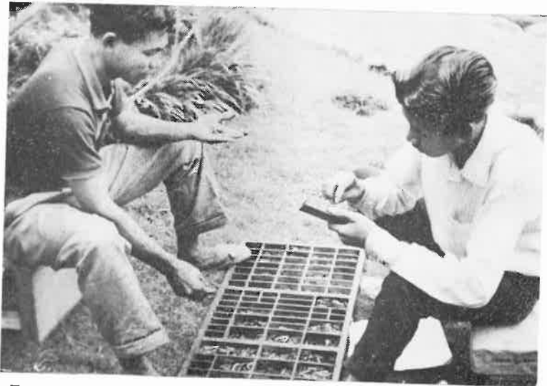
Two students—One setting type and one returning type to the trays after use.

The students help in this printing work by setting type and assembling the printed material for binding.