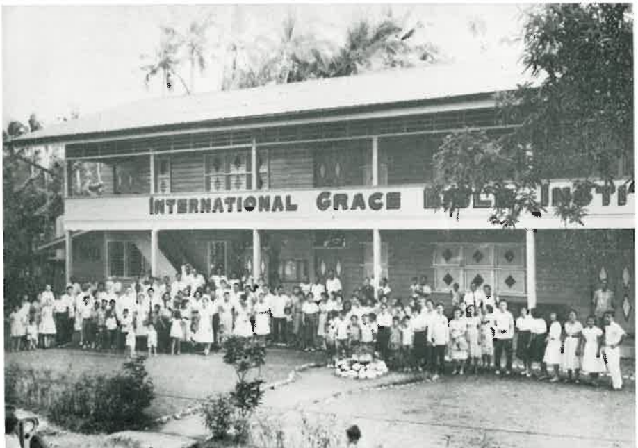
International Grace Bible Institute, Philippine Islands