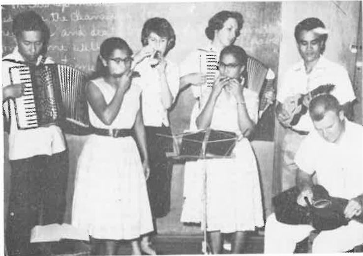
Just for fun! A group of amateur musicians giving a special number at one of the monthly hymn sings.