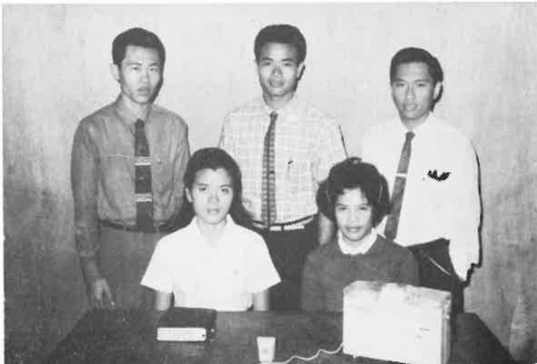
Radio broadcast recording team. Back row—second year students. Front row—first year students.

The InterNational Grace Bible Institute has entered the radio ministry as one of the student service activities. A team of students record the broadcasts in the dialects and these are sent to the radio stations. It is the desire of the School to have at least ten one-half hour programs per week by the end of this year. A sound-proof recording room has been built at the school and a tape recorder has been received from the States for this ministry. Several networks have opened stations to the school for Gospel programs and now most of the Islands are under the sound of the Gospel of the Grace of God.