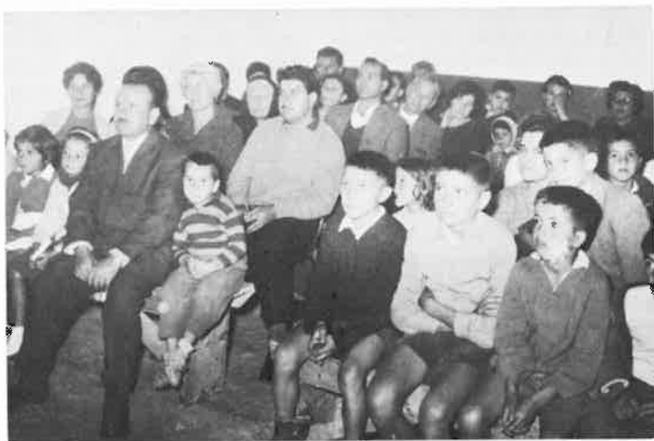
Some of the congregation at the Athens Grace Church.