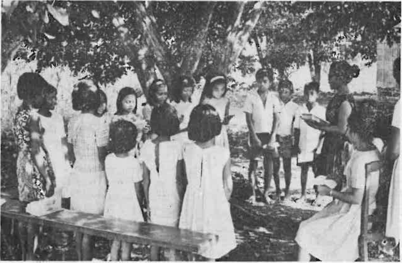
Bible Woman with Class at a Public School.

Since 1962 a new work has been started with a tribal people called the Atas. One of the first graduates from IGBI has started a training school for these people. At the school they are taught to read Cebuano, the language which they can speak but cannot read. The Bible is in the Cebuano language so once they learn to read then they are taught to read and study the Word of God. Several churches have been established among these people and several workers are in this area. This year another graduate from IGBI will assist in the work there.