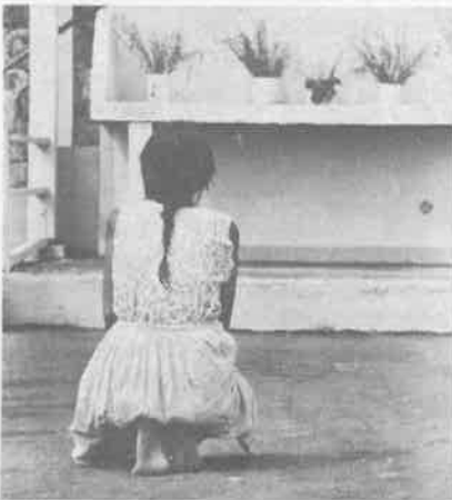
A form of paganism

Man by nature is a religious being seeking to worship something—man, trees, rivers, birds, etc. He sees that there is someone or something bigger than himself. His conscience is troubled and his soul is not at peace so he will do anything to find peace. In highly educated countries man will turn to more sophisticated things such as modernism, or liberalism, but in the underdeveloped countries he will resort to paganism, worshipping wooden idols, trees, cows. In the Philippines we have a different form of religious worship as the people seek to worship the same God and His Son as we do but it takes the form of paganism, bowing down to idols with religious names, worshipping men in long robes, saying written prayers, and