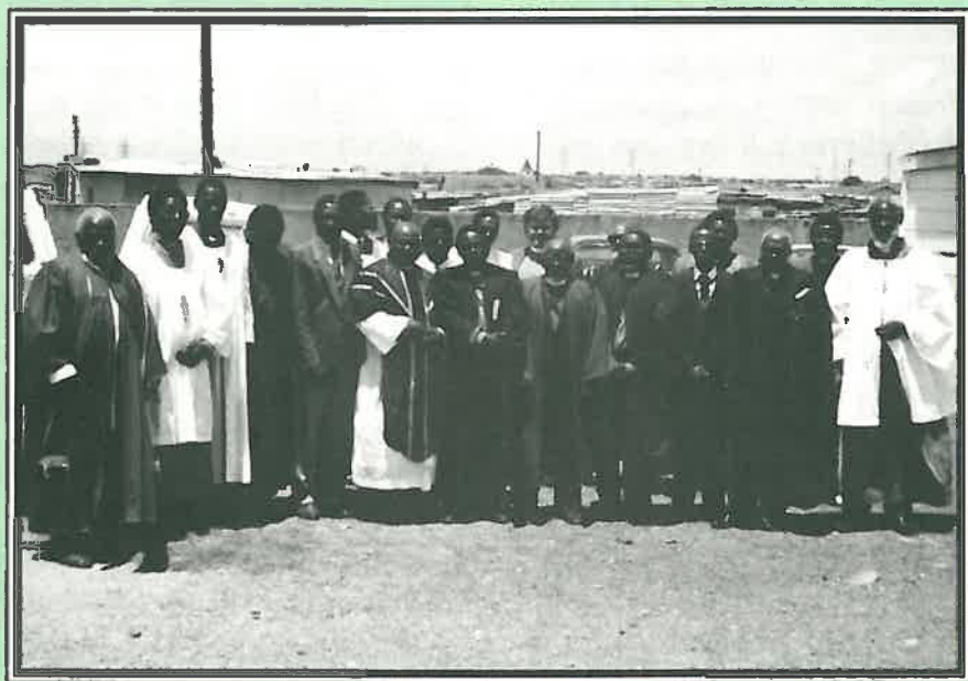
Pastors from the Xhosa tribe (South Africa) being trained by Bruce Woolard