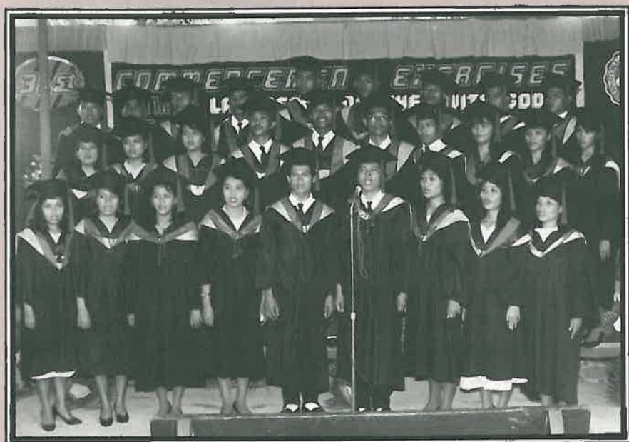
Twenty-eight new graduates from International Grace Bible Institute, Philippines Future Philippine Leaders