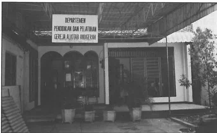
This is the "Department of Education and Training, Indonesian Grace Bible Church" under which the Bible School operates

headquarters and youth ministry. The other two are assigned to the islands south of the Philippines (still Indonesia) in the Siau and Tagulandang congregations. These two congregations have been years with no church workers. Siau was the most persecuted congregation yet it was the first to own a nice, permanent church building. Tagulandang has its own church building too. The remaining three students who graduated with 60 credit hours (Certificate Program) are assigned to help in congregations under the supervision of the pastors to work in children's and youth ministries.