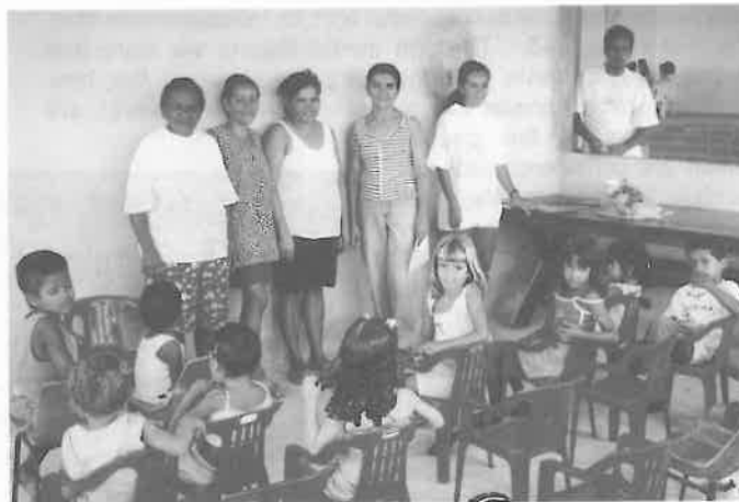
Some of the children and helpers involved in Project Abba

Other ministries in the North include "Project Abba," a weekly children's Bible Club reaching out to over 150 children. The LeFEBERS have formed a team of 15 volunteer teachers and helpers to provide Bible stories, songs, practical lessons and a healthy snack to needy area children. This program is housed in the Ibura Bible Church where services and Bible studies for men, women, and youth are offered on an almost daily basis.