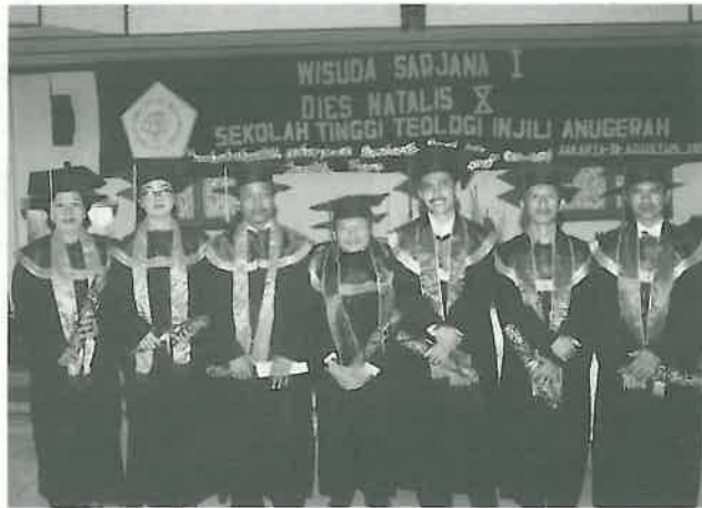
1998 Graduates of Grace Bible Institute in Jakarta

In West Irian, our work is found in Jayapura, the capital city, and Sorong. In Celbes there are congregations in the