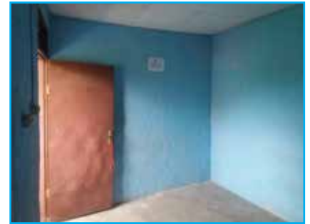
Our NGO classroom